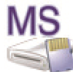
Memory Stick (M:)