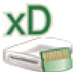
xD Picture (K:)