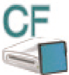
Compact Flash (J:)