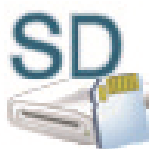
SD Card (L:)