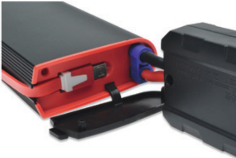
Diagram 2: EC5 output clamps connect with car battery