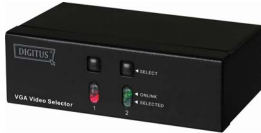
2 Port (DS-44100)