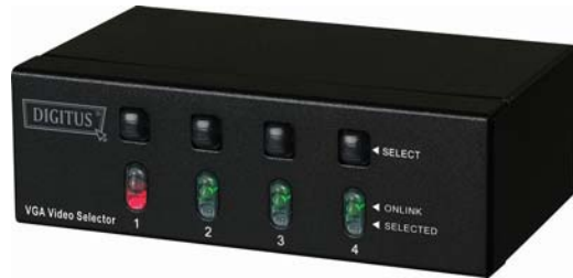
4 Port (DS-45100)