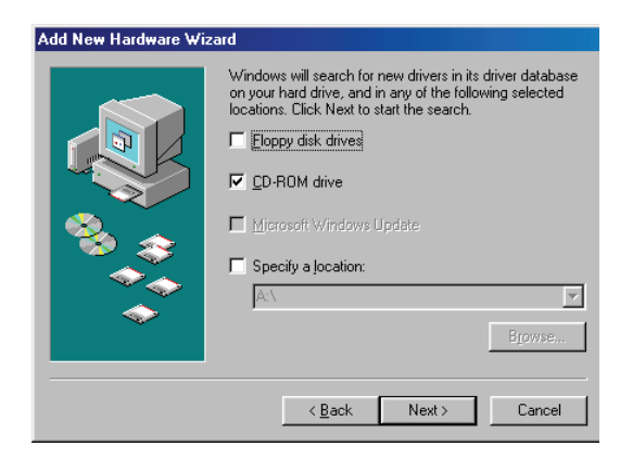
C. Please insert the "Windows 98" CD into your CD-ROM drive. Click "CD-Rom drive" and press "Next" to continue. (Ref. Fig. C)