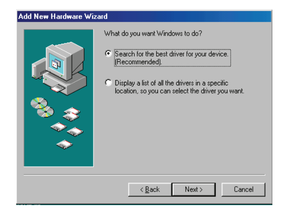
B. Select "Search for the best driver for your device" and press "Next" to continue. (Ref. Fig. B).