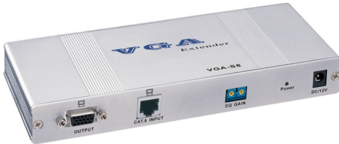
DC-53602 / DC-53702