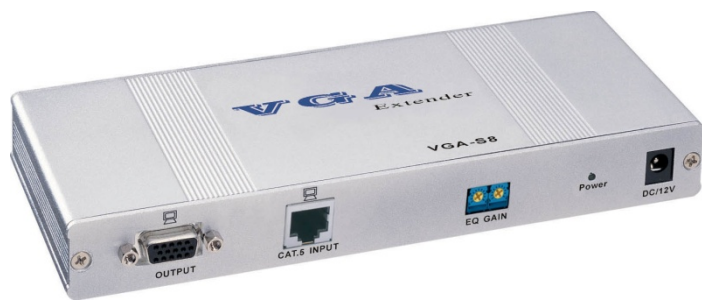
DC-53602 / DC-53702